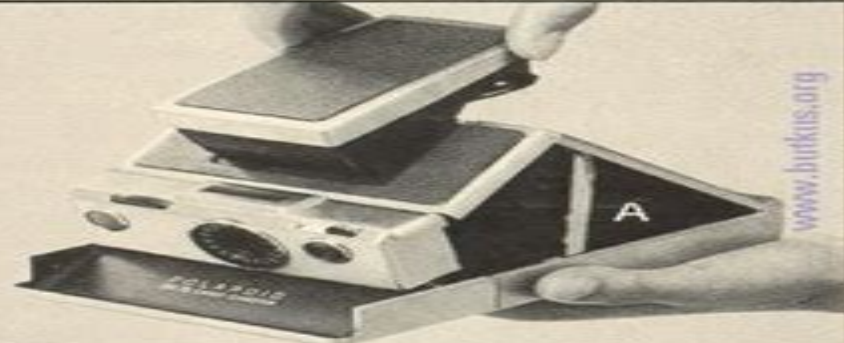
4. ...until cover-support (A) locks.