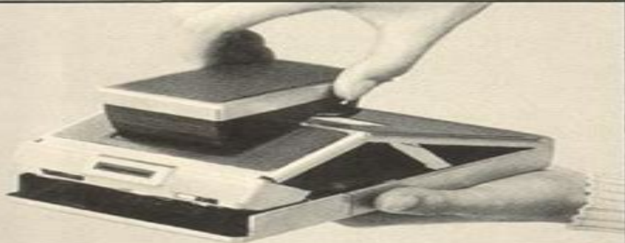
3. Pull straight up...