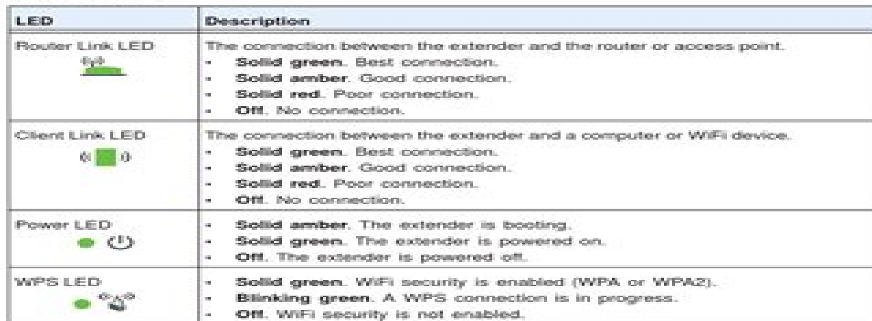
Table 1. LEDs