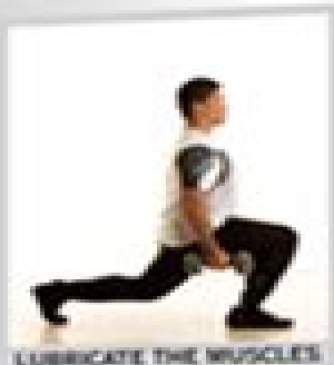
LUBRICATE THE MUSCLES