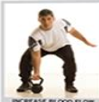
INCREASE BLOOD FLOW

The Breakthrough Way to Heal Your Muscle and Joint Pain for Good