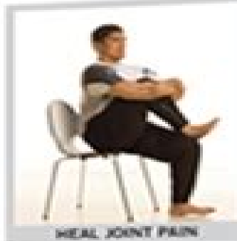
HEAL JOINT PAIN