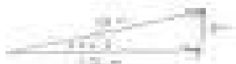
2a. 50 units, 53.1° north of East