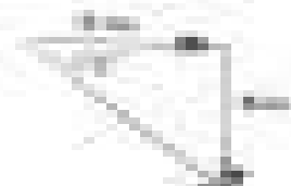
1c. 10 units, 0° north of East

2. Use the following diagrams to determine the magnitude of the resultant. Label the resultant with magnitude and direction. (10 points)