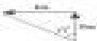
1b. 10 units, 0° north of East