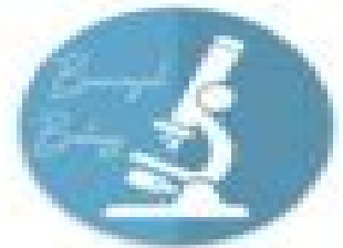
Properties of Water Chart

Directions: Fill in the table below on the five properties of water.