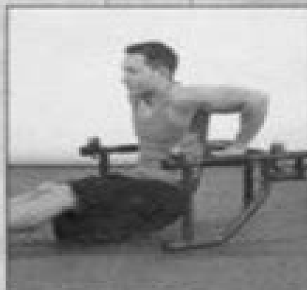
Tricep Dips (L2 Seated Dip)