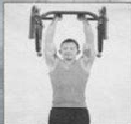
Overhead Press — Close Grip