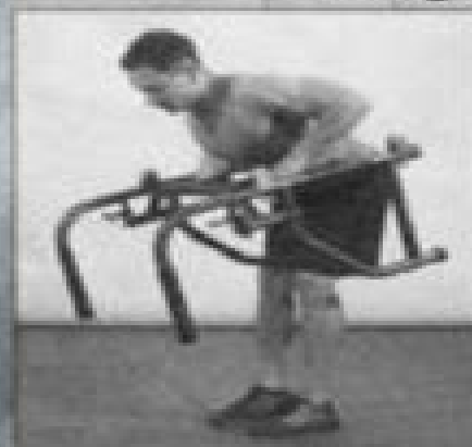
Bent Over Row — 45. degree