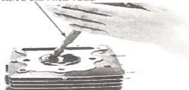
(1) VALVE LAPPING TOOL

Take care not to allow the compound to enter between the valve stem and guide.