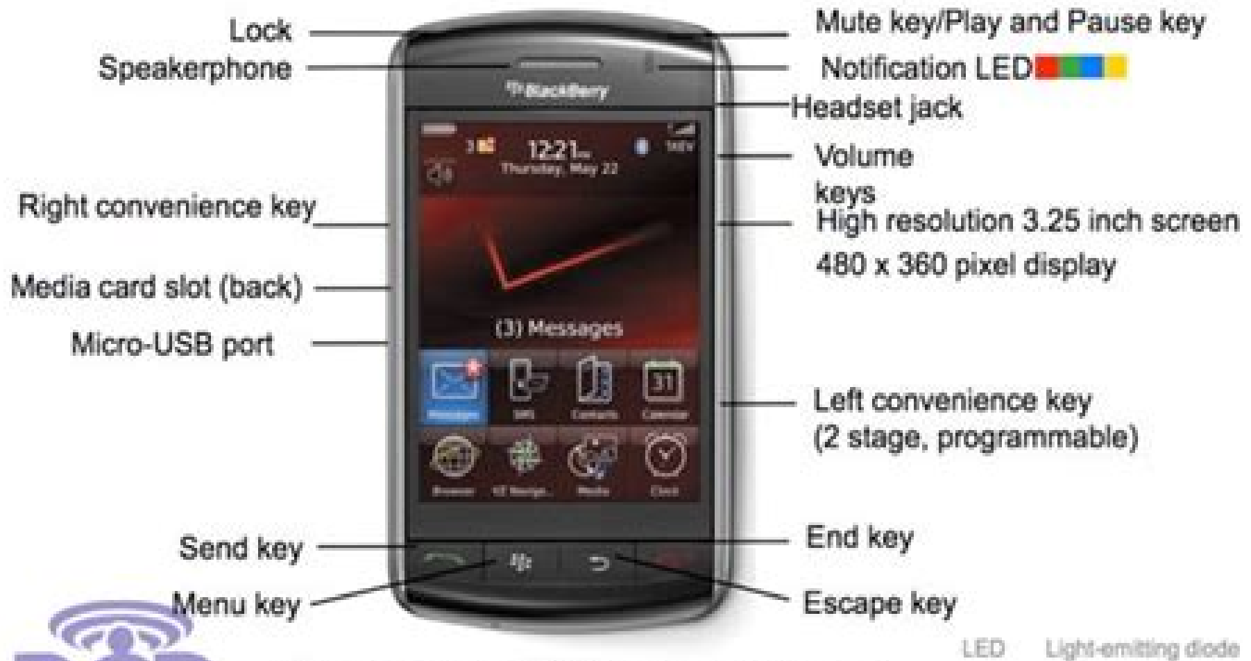
BlackBerry 9530 smartphone