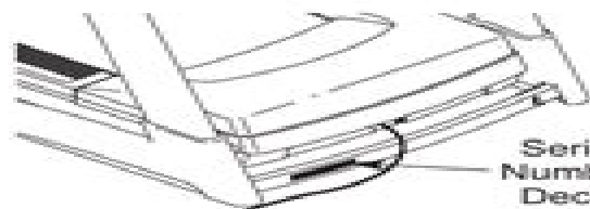
Serial Number Decal

Write the serial number in the space above for reference.