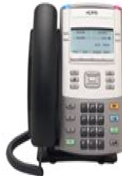
IP Phone 1120SA Getting Started Card

© 2006 Blackwell Publishing Ltd, Journal of Internal Medicine 260: 103–110