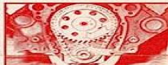
FIGURE 1. Timing marks lined up.

5. Remove the timing sprocket, reinstall a new timing chain and bolt the assembly in place as shown in Fig. 4. Coat the bottom of all lifters with Crane Assembly Lube and drop them into the lifter bores (Figure 5). Tighten the timing sprocket retaining bolts to correct torque specifications. This is very important as ninety percent of all cam damage is caused by the timing gear coming loose due to improper torque on bolts or worn keys or keyways. If the gear loosens, the cam will slide back in the block, causing the lifters to hit the lobes and bearing journals. Use proper torque and a locking material applied to threads for camshafts with only one bolt. Cams with three gear bolts should have bolt heads drilled and safety wired.