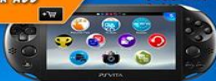
PLAYSTATION VITA 2000 CONSOLE