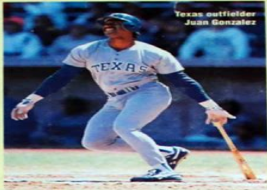
Texas outfielder Juan Gonzalez

With ALL THE STATS YOU'LL NEED to prepare for Rotisserie® and most fantasy baseball leagues!