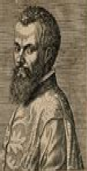
DESIDERIUS ERASMIUS ROTTERDAMI, FLORENTINUS, FLORENTINUS