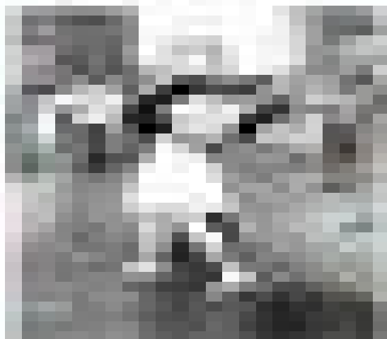
Portrait of a woman