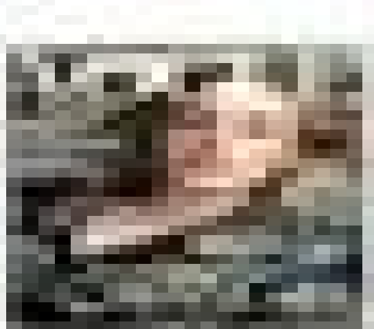
Portrait of a woman