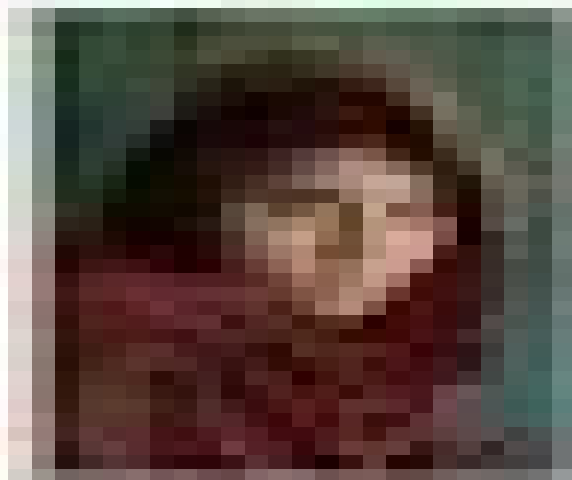
Portrait of a woman