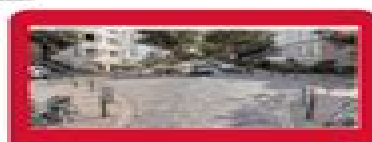
Figure 1: Example of a 360-degree view of the street scene around geo-coordinates