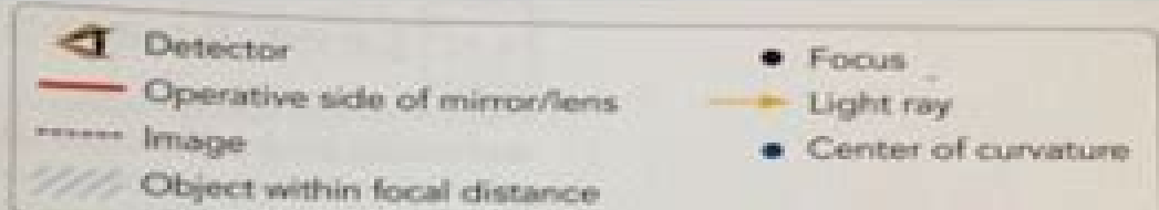
Image SAME side as Observer