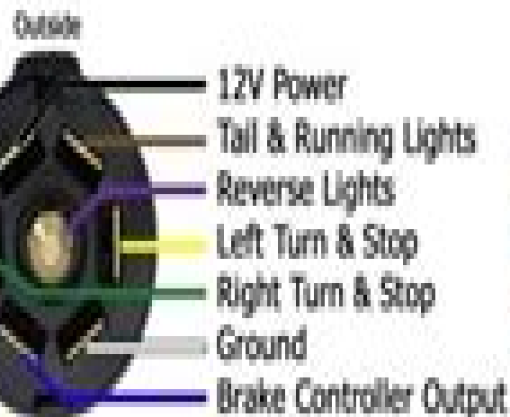
7-Way Traditional (Utility/Equipment/Cargo Trailers)