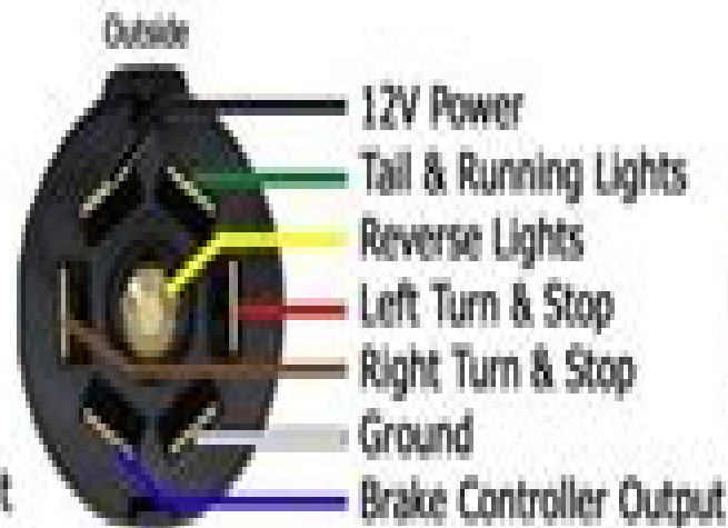
7-Way RV Standard (5th Wheel/Travel Trailer/Camper)