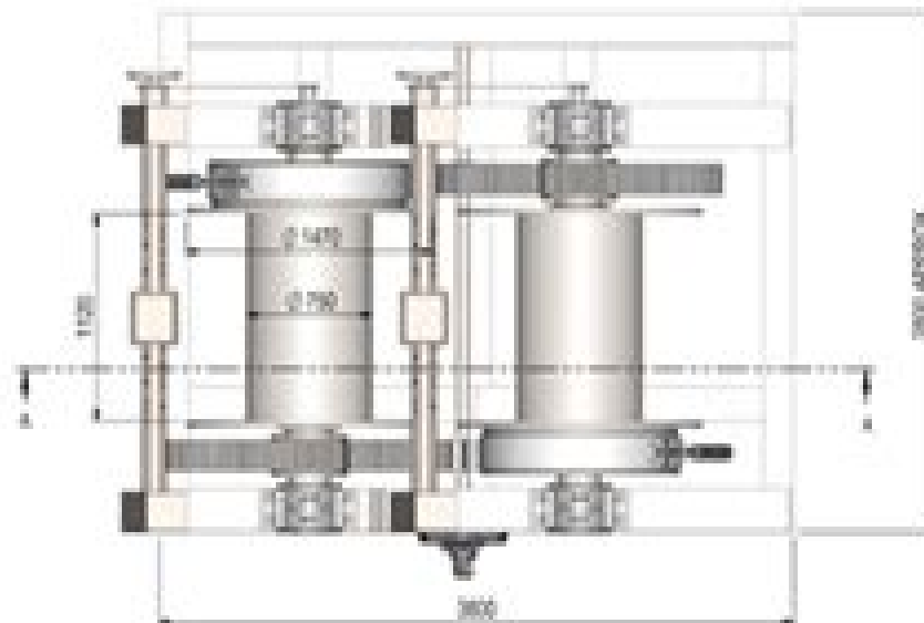
PLAN SCALE 1 : 30