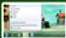
Enjoy your music better

Windows 7 Home Premium makes it easy to create a home network and share all of your favorite games, and music. You can watch movies, pause, rewind, and more! To see the best entertainment experience with Windows 7 Home Premium.