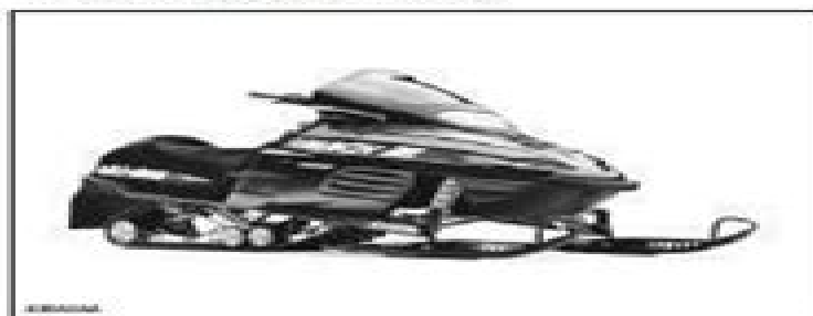
TYPICAL — CX3 SERIES