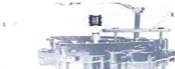
1. Crankcase separating tool

Tighten the securing bolts on the crankcase separating tool, but make sure the tool body is parallel with the case. If necessary, one screw may be backed out slightly to level tool body.