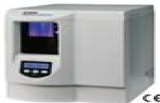
Hydrogen generator technology

These units are compact, requiring only one square foot of bench space, and come with a set of standard power adapters for U.S., European and Asian plug types. Provided and supported by an ISO 9001 registered organization, Parker Balston® hydrogen generators are the first built to meet the toughest laboratory standards in the world: CSA, UL, cUL, and CE Mark.