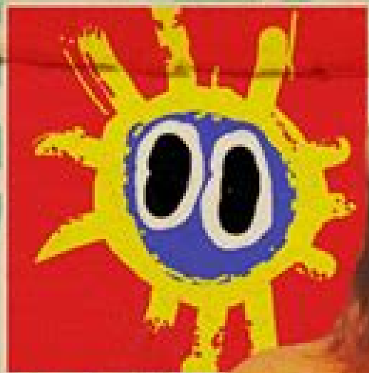
The Brian Jonestown Massacre