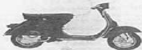
Fig. 2 - VESPA 125 PRIMAVERA