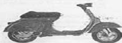
Fig. 1 - VESPA 50 R - 50 SPECIAL