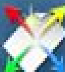
CamScanner Toolbox X