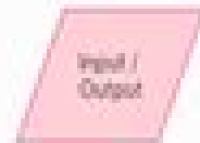
Input / Output

Any adjustments which must be added manually