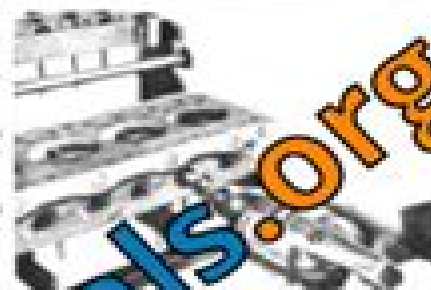
Fig. 17. Cleaning the cylinder head.

of the cylinder head, incorporating an air pressure gauge and an adaptor to which a hose can be clamped as an air pressure pipe.