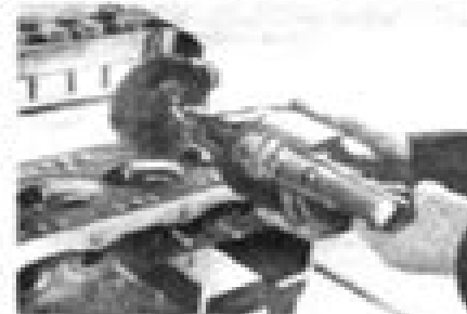
Fig. 31. Using a machine operated wire brush to clean a cylinder head.

4. Check the cylinder head contact face for distortion with an engineer's straight edge and feeler gauges as shown in Fig. 32. If the face is distorted in excess of .005 in. (.13 mm.) longitudinally, or .003 in. (.08 mm.) transversely, the cylinder