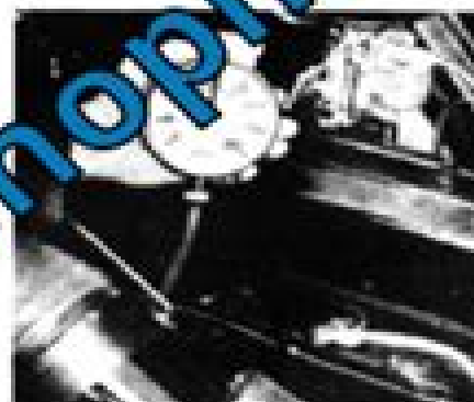
Fig. 16. A compression gauge recording the pressure during a compression test.