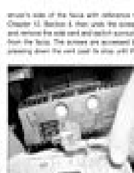
4.6a ... undo the heater retaining screws using sockets from the panel ...