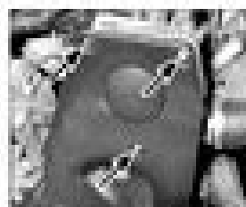
4.7 Timing belt upper cover retaining bolts (removed)