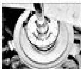
4.6 Fit the new retaining bolt and tighten it as described in the text