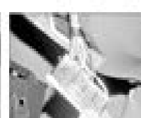
4.10 Undo the clip ... and withdraw the screw from the surround