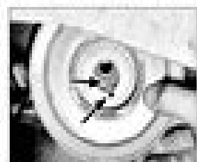
4.5 Refit the crankshaft pulley aligning the cut-out with the timing notch on the crankshaft sprocket (removed)