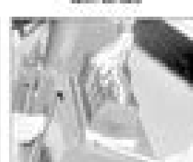
4.9 Undo the clip ...