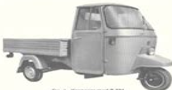
Fig. 1 - Vespacar mod. P 501