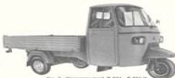
Fig. 2 - Vespacar mod. P 601 - P 601 V