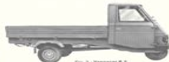
Fig. 3 - Vespacar P 2