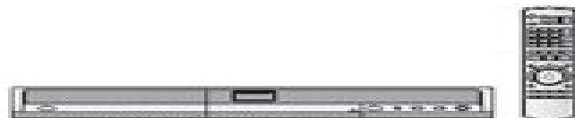
The illustration shows DMR-EX75.