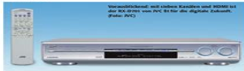
Voraussetzungen: mit sieben Kanälen und HDMI ist der RX-D700 von JVC fit für die digitale Zukunft.