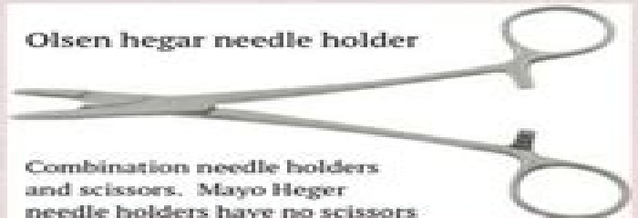
Olsen hegar needle holder

Combination needle holders and scissors. Mayo Heger needle holders have no scissors