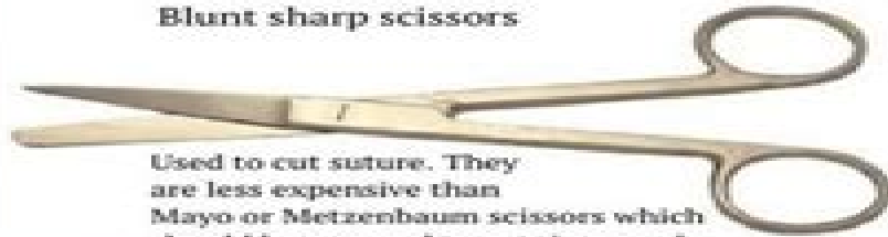
Blunt sharp scissors

Used to cut suture. They are less expensive than Mayo or Metzenbaum scissors which should be reserved to cut tissue only.