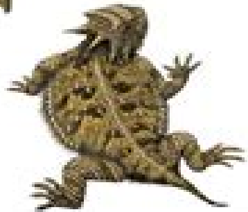
Texas horned lizard ( Phrynosoma cornutum )