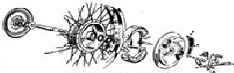
Front wheel assembly, twin leading shoe brake