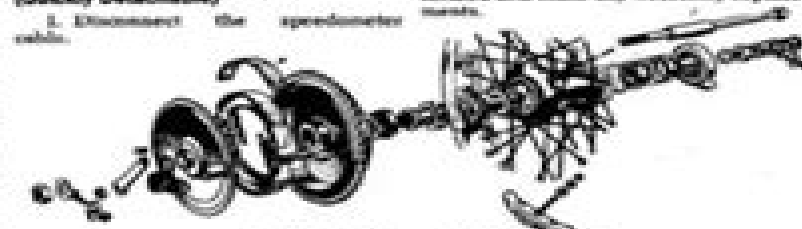
Quickly detachable rear wheel (500 and 650)

Examine all parts as previously described and make any necessary replacements.