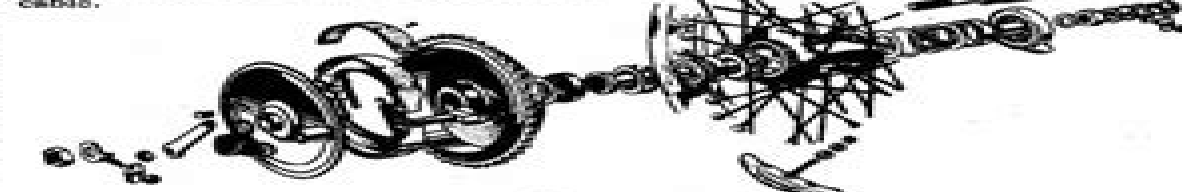
Quickly detachable rear wheel (500 and 650)

2. Unscrew the axle from the right side of the machine and pull out the distance collar.