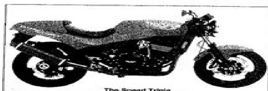
The Speed Triple

easy to see that taking on the Japanese on their own territory – something Triumph said they never intended to do – was not a good idea, up against the cutting edge race-replicas of the day the Daytonas couldn't live up to their billing as sportsbikes.