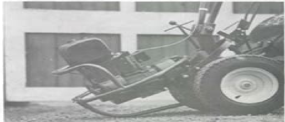
WRAP-A-ROUND BUMPER/GUARD Full wrap-a-round protection for the carburetor and front of engine. Serves as mount for Dozer/Snow Blade too. #1219 $44.00