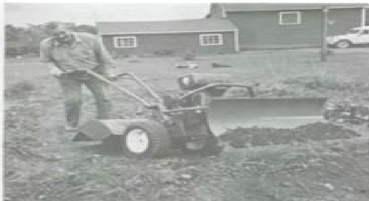
DOZER/SNOW BLADE AND BUMPER A versatile "homestead helper". Takes most of the heavy work out of light snow plowing and earth moving. #1243 $129.00