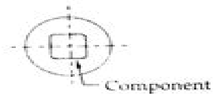
Fig. 3.1. Terms for press tool parts (Compound Die).

Strip Guide machined directly into stripper plate