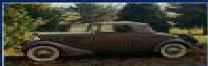
1934 Ford Cabriolet