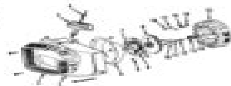
Diagram of a chain saw engine and handle assembly. The diagram shows the engine, handle, and various adjustment points. The numbered callouts are: