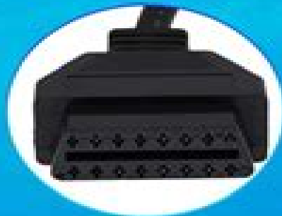
OBD 16PIN CONNECTOR