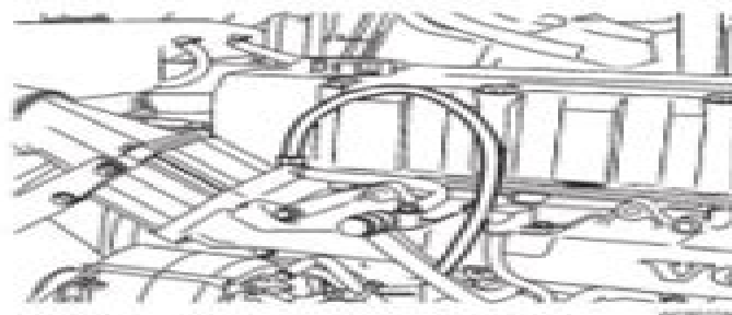
Fig. 2: Overflow valve location, D12C

Important: When changing an overflow valve to the new 450 kPa (65 psi) bar version, the fuel pump must also be changed to the 450 kPa (65 psi) version. However, when changing a fuel supply pump to the 450 kPa (65 psi) version, you are not required to change the overflow valve.