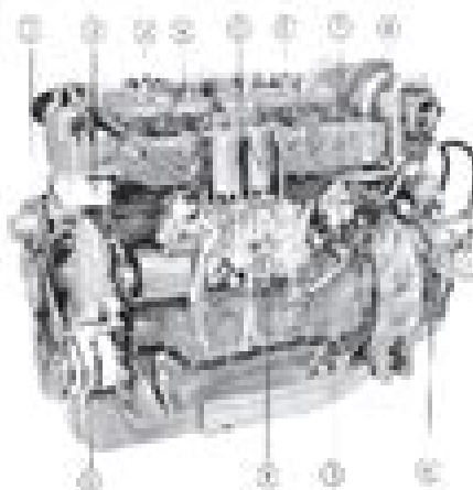
Fig. 4 Engine engine, TAMD60

The fuel system is well protected from interruptions during running by means of an electric, replaceable fuel filter. On the TAMD60 engines the fuel injection pump is large mounted under the other engine from the pump fitted on a bracket.