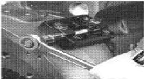
Special tool no. 30 — Mounting the flywheel housing