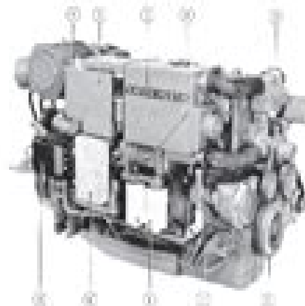
Fig. 3 Engine engine, TAMD60

The engines are fitted with a heat exchanger for thermodynamic, controlled fresh water cooling of the engine block, cylinder heads and exhaust manifold. The exhaust manifold cooling panel is designed so that it also cools at the exhaust ports.