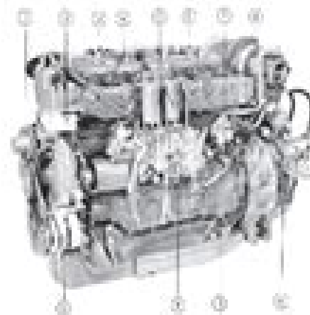
Fig. 4 Engine engine, TAMD60

The fuel system is well protected from interruptions during running by means of an electric, replaceable fuel filter. On the TAMD60 engines the fuel injection pump is large mounted under the other engine from the pump fitted on a bracket.