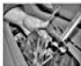
11.49 ... then remove the bracket

35 Working through the timing hole, apply the four bolts securing the head to the mounting bracket in the block (see illustration).