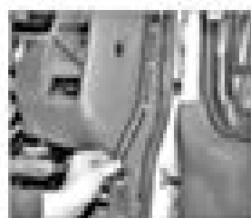
11.46 Remove the retaining clip and screw the head into the block and the conditioned wire flange from the mounting bracket