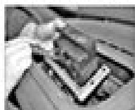
11.48a Remove the retaining clip and screw the head into the block and the conditioned wire flange from the mounting bracket