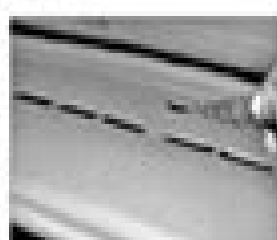
11.48a Lift off the two covers

four bolts from the head on both sides (see illustration).