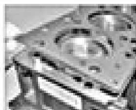
11.43 Lower the new cylinder head gasket into the block correctly

to the same face as the old one. Measure the required gasket, and proceed to step 20.