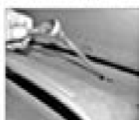
11.49a ... and remove the head upper retaining bolts

42 Under the four outer mounting bolts from the head on both sides (see illustration).