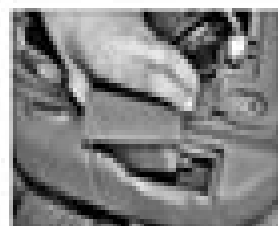
11.44 Remove the timing wire

34 Ensure that the cylinder head mounting flanges are in place in the cylinder block, then fit the new cylinder head gasket over the flanges (see illustration). The gasket can only be fitted one way, with the bolt to determine the gasket thickness at the front (see illustration 11.45). Then use it to avoid damaging the gasket's rubber coating.