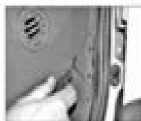
11.47 Using a small screwdriver, remove the bolt covers from the head on both sides