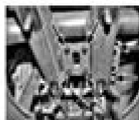
11.45 Under the oil bolts (pistons) securing the head to the block, mounted in the block