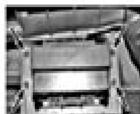
11.47 Under the four bolts (pistons) securing the head to the block, mounted in the block