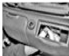
11.45 ... and disconnect the timing connector from the opposite flange