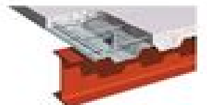
H/L Headed Concrete Anchors