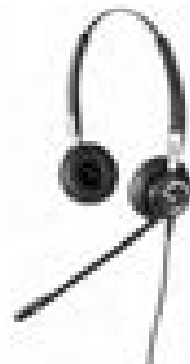
Jabra BIZ 2400 Duo