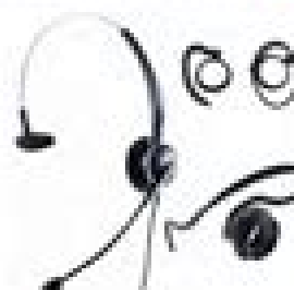
Jabra GN 2104