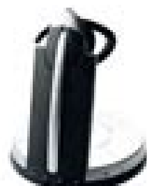
Jabra GN 9300