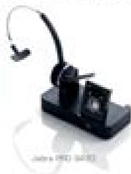
Jabra PRO 9400