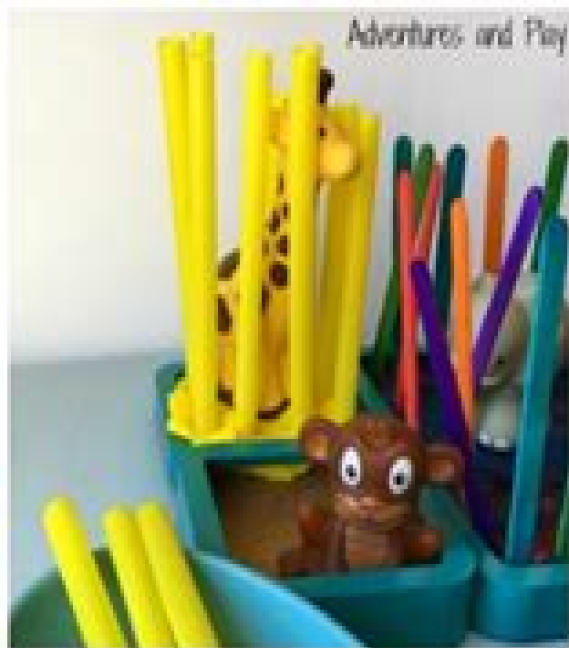
Adventures and Play